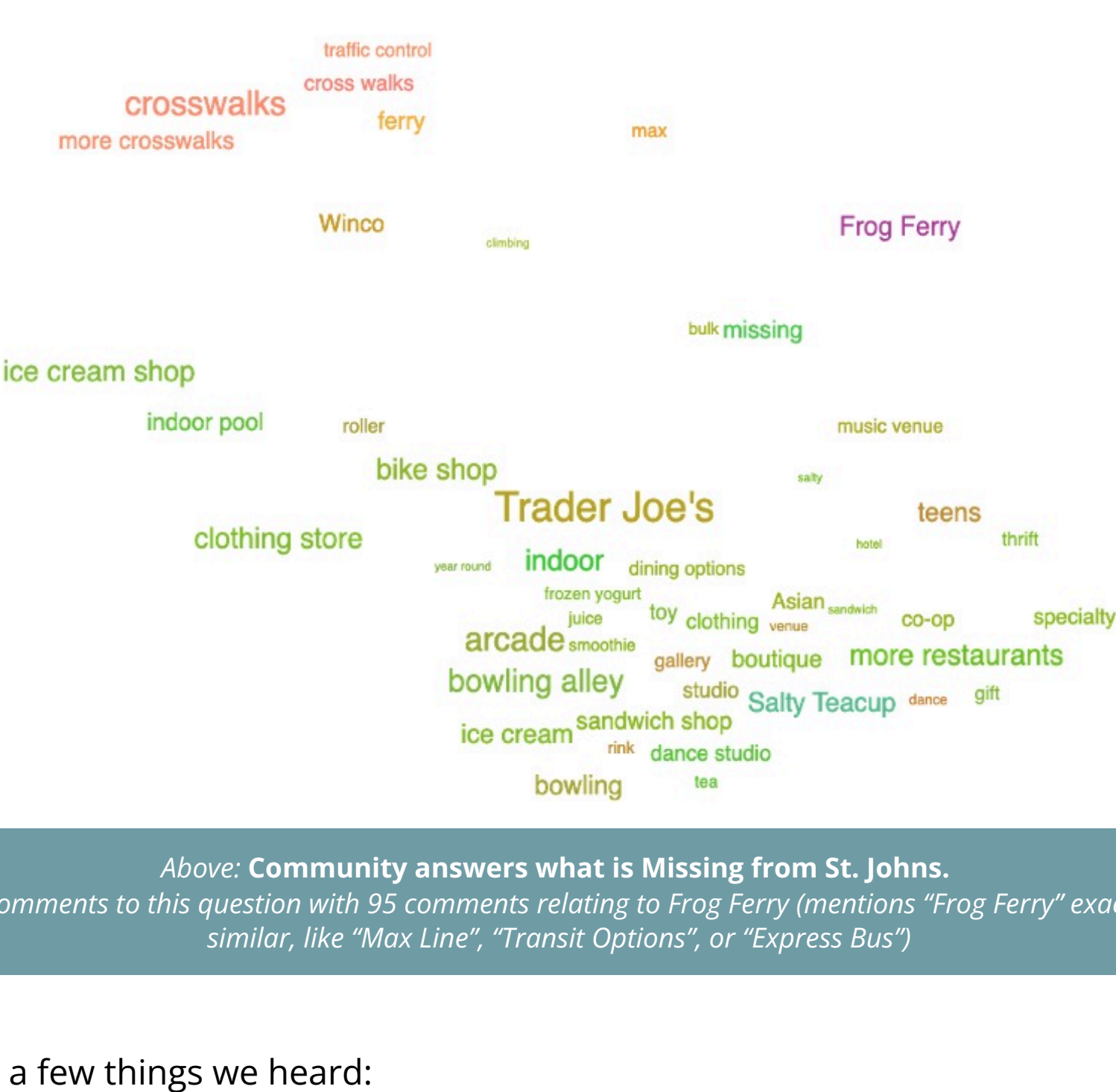
Above: Community answers what is Missing from St. Johns. 734 comments to this question with 95 comments relating to Frog Ferry (mentions "Frog Ferry" exactly or similar, like "Max Line", "Transit Options", or "Express Bus")