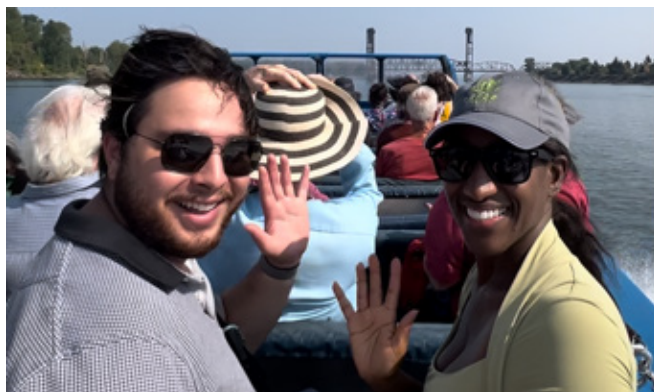
Community River Run. A joyful journey.