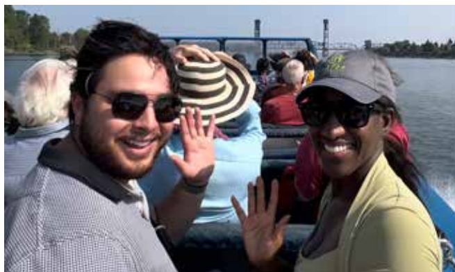
Community River Run. A joyful journey.