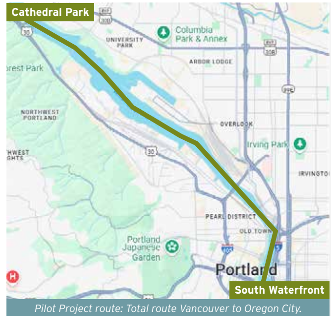
Pilot Project route: Total route Vancouver to Oregon City.